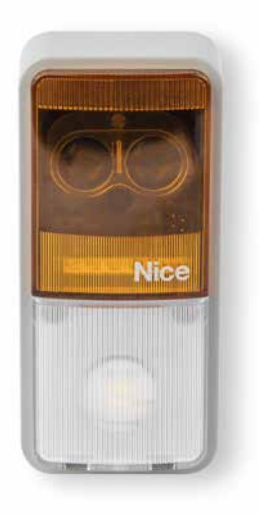
EPMOR, Easier faster installation.

The new medium sized optical devices with reflective and wireless technologies complete the range of Nice photocells, making it easier and quicker to ensure the safety of automation systems.